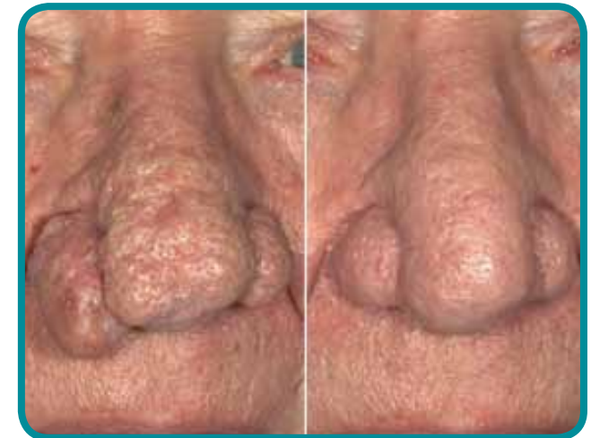
Before and after treatment

If you are treated with one of the vascular or pigmentation lasers, the treated area may be swollen for several days following treatment. This is to be expected. Scabbing or blistering is less frequently seen. Usually ice packs are supplied intermittently to the treated areas for the first 48 hours. If scabs form, rubbing or excessively vigorous cleansing should be avoided. Any scabs usually settle within a week. Make-up and sunscreen may be worn during this time. Protection from ultraviolet light (natural or artificial) is advised.