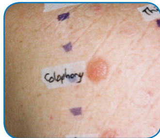
example shown of positive patch test reaction

Interpretation of patch tests requires considerable skill. Not all positive tests are relevant, so it is necessary for the dermatologist to interpret the meaning of the reaction. If this testing is negative, it may indicate that you have a different condition, such as irritant contact dermatitis, eczema, or contact urticaria. Another form of testing known as prick testing or a blood test is used to diagnose this condition. If you develop redness, swelling or blisters after your last visit, it may mean that you have a delayed reaction.